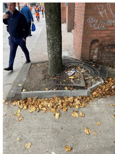
Opp. 5 Glengall St Broken tree root cover