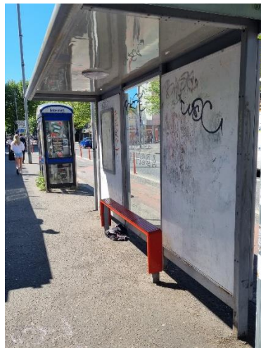
14 Dublin Rd Redundant bus shelter