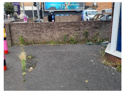
Great Victoria St - outer perimeter of Bruce St car park