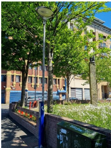
Bankmore Square Redundant lamp post