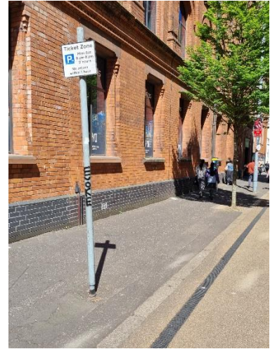
1 to 91 Adelaide St 10x on-street parking notices redundant due to removal of on-street parking spaces following installation of the Adelaide St footway extension