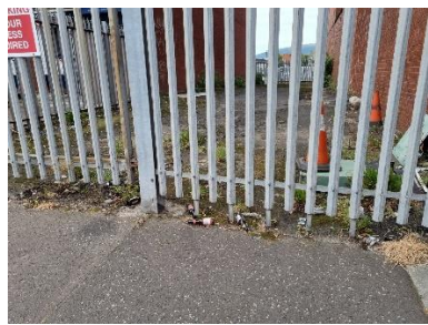
77 Great Victoria St - along gap site frontage