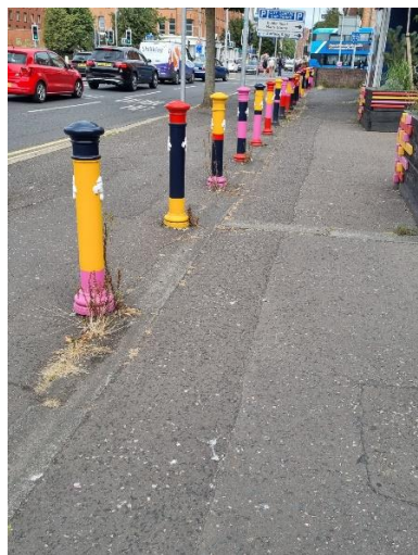
Great Victoria St - along bollards