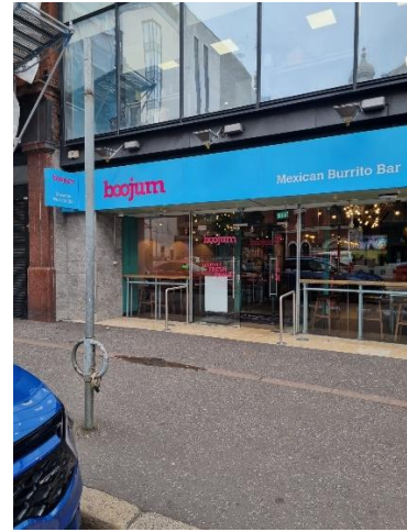
14 16 Great Victoria St unused street post