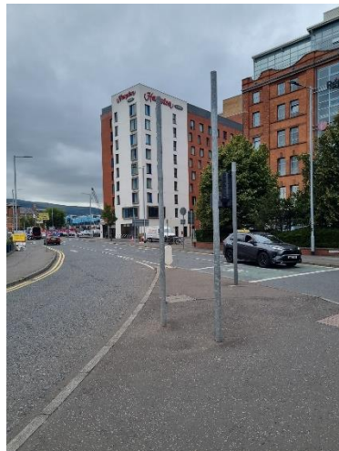
Corner Bruce St / Great Victoria St 2x unused street posts