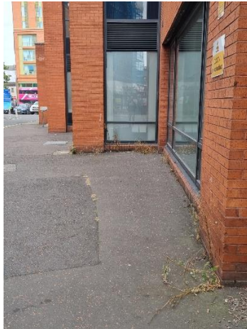
Little Victoria St - along NICS frontage