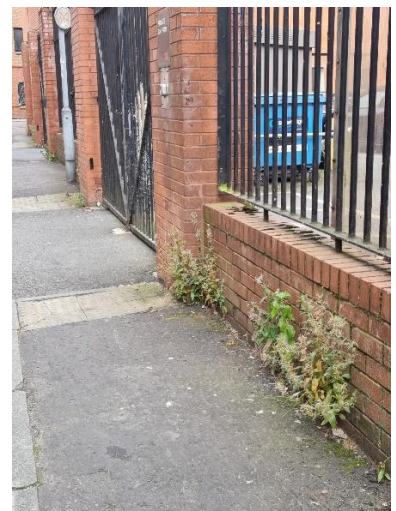
Harmony St - along NICS car park