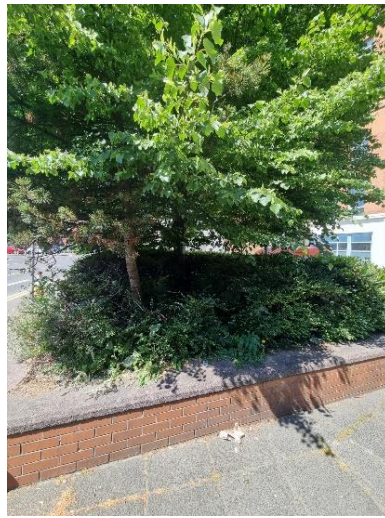
45 Great Victoria St Hope St poorly maintained planting