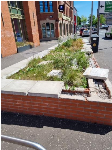
27 Bruce St poorly maintained planting