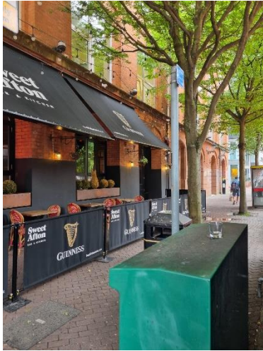
12 Brunswick St on-street parking notice redundant due to removal of on-street parking spaces following installation of the FLAXX Social Space