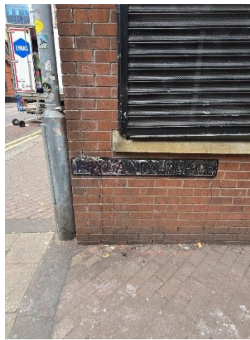
Keyland's Place Damaged street sign