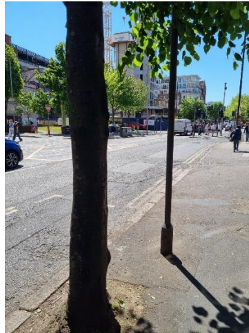
34 Bedford St unused street post