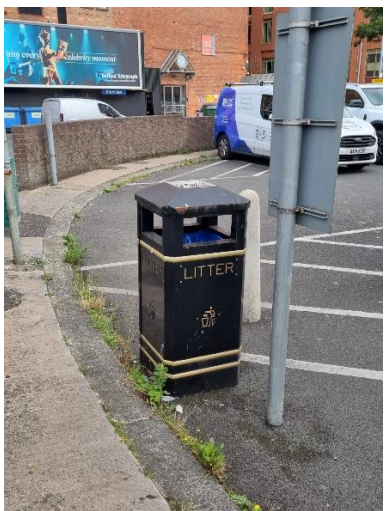
Bruce St - inside Belfast Council car park