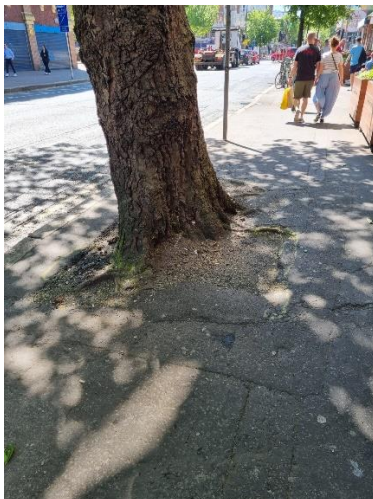
39 43 Bedford St uprooted pavement