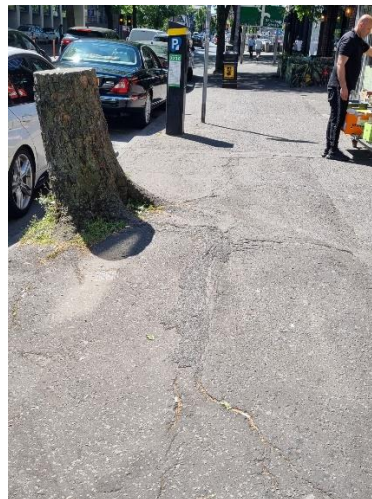
83 Dublin Rd uprooted pavement