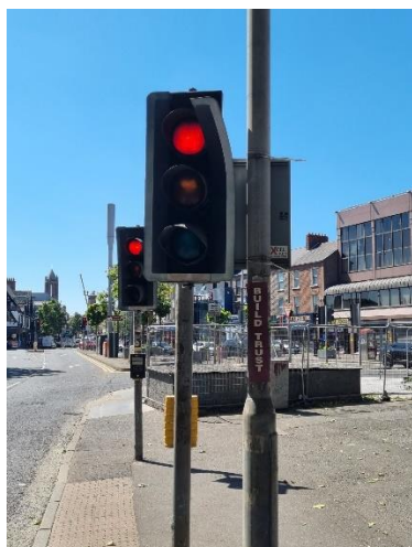
97 Dublin Road damaged traffic lights casings