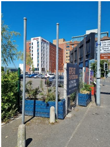
69 Great Victoria St 2x unused street posts