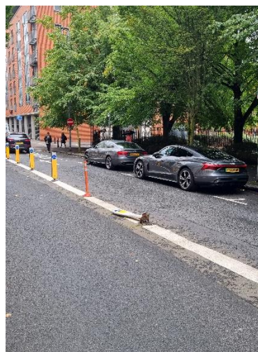
Alfred St - behind Clarence Court damaged cycle lane bollard