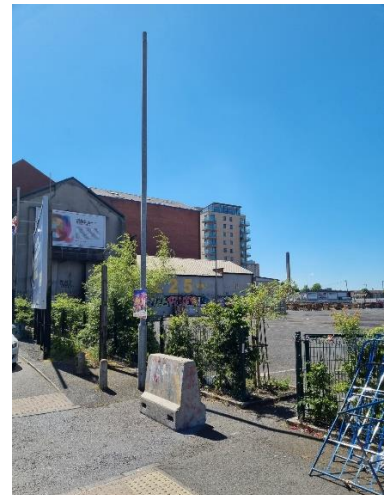
69 Great Victoria St unused lamp post