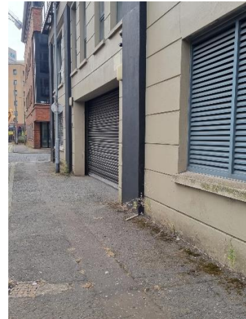
Little Victoria St - Community Places Ni frontage