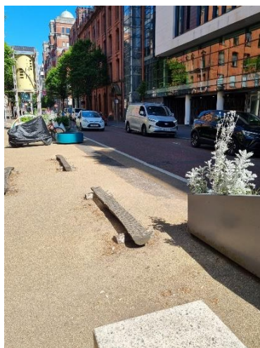
81 Adelaide St missing planters