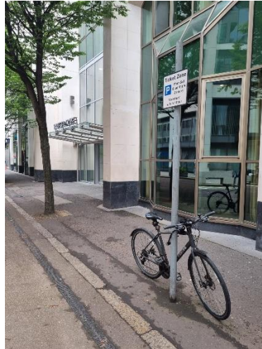
4 Adelaide St 2x on-street parking notices redundant due to removal of on-street parking spaces following installation of the Adelaide St footway extension