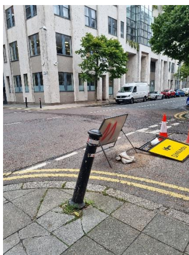
21 Linenhall St damaged bollard