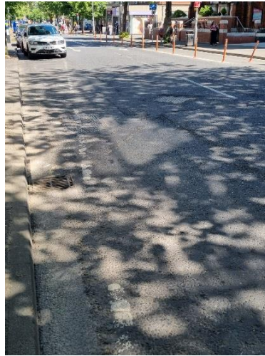
42 Dublin Rd Faded road markings