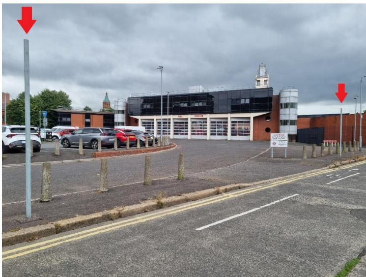
Bankmore St 2x unused street post