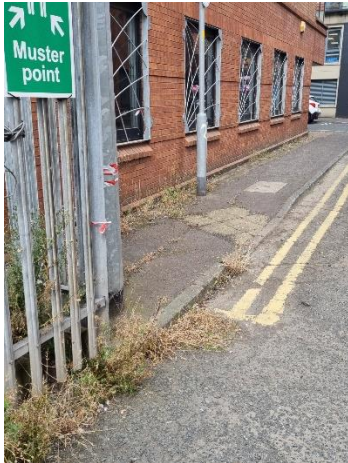
Harmony St - Downshire House frontage