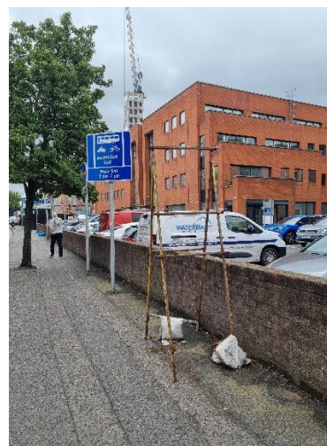
Bruce St - car park redundant traffic works notice