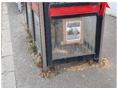
14 Dublin Rd - around phone booths