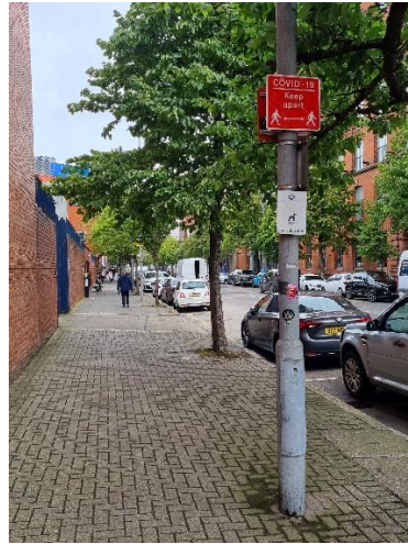
Linenhall St - back of BBC redundant Covid signage