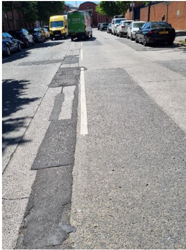
28 - 40 Linenhall St Faded road surface