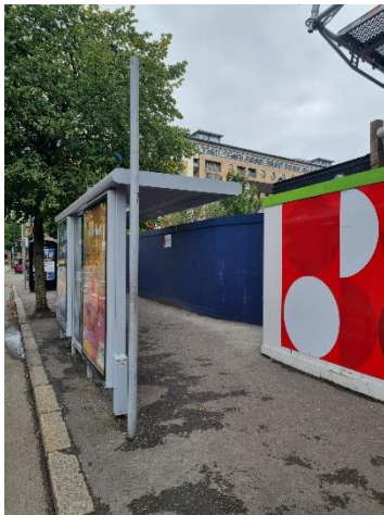
14 Dublin Rd (1) unused street post