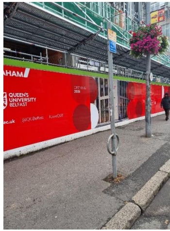
14 Dublin Rd (2) unused street post