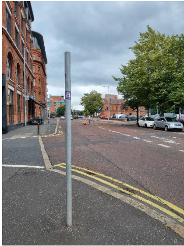
11 Ormeau Ave unused street post