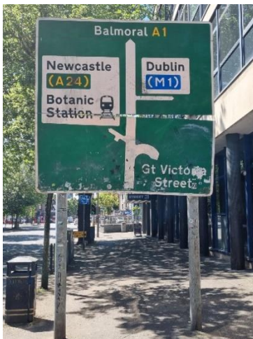
42 Dublin Rd broken / dirty street sign